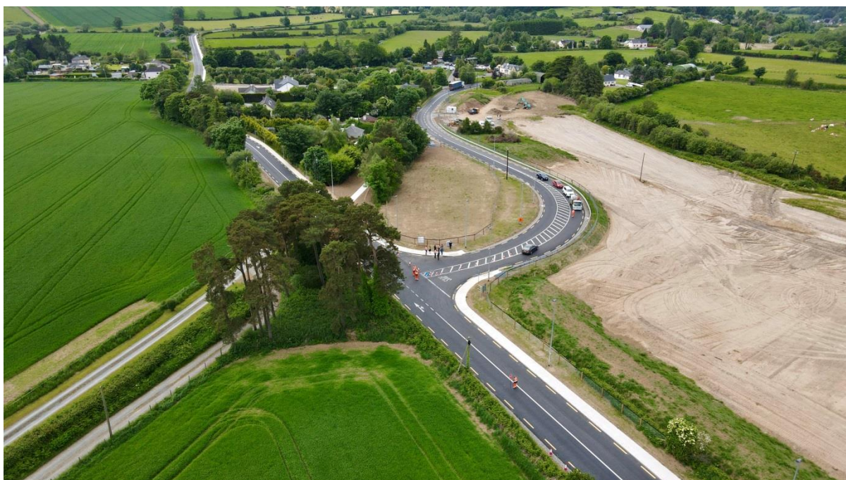
Drone footage Ballinaclash Junction